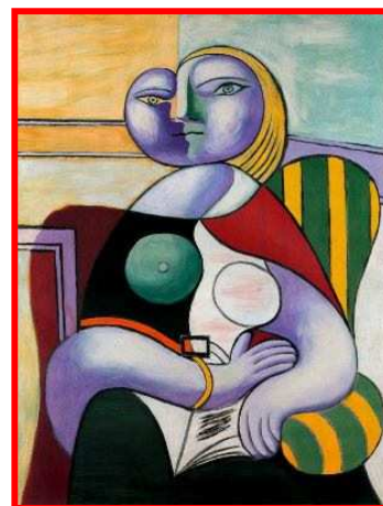
"Reading" by Picasso