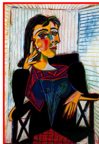
"Portrait of Dora Maar Seated" by Picasso